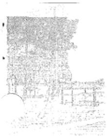
FRESH AND SALTWATER SPORTS ON CHOCTAWHATCHEE BAY