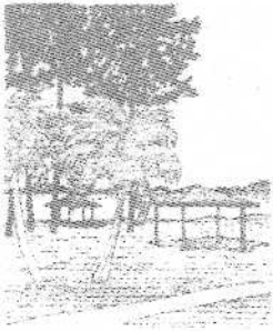
FRESH AND SALTWATER SPORTS ON CHOCTAWHATCHEE BAY